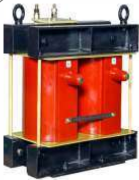
NEUTRAL GROUNDING TRANSFORMER